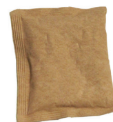
Desiccant in Kraft Pouch