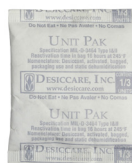
Desiccant in Tyvek® Pouch